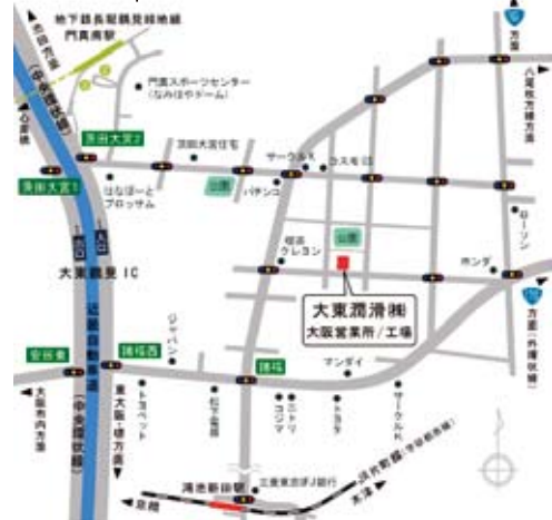
【 Access map to Osaka Sales Office 】